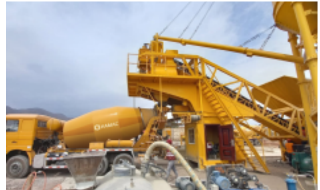
Mobile concrete batching plant is working