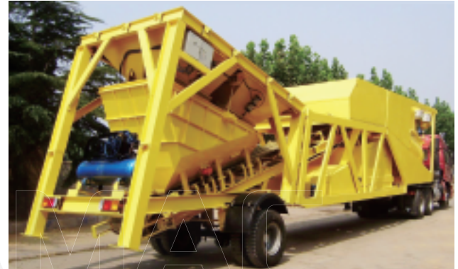
Mobile concrete batching plant is being transported